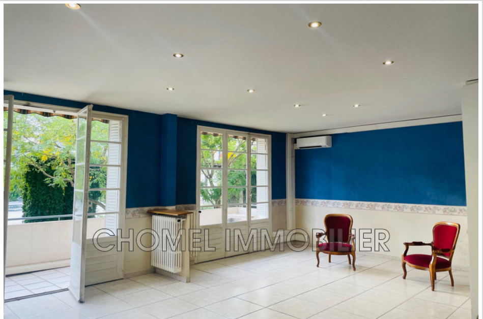
Apartment ref. 603V206A Villeurbanne